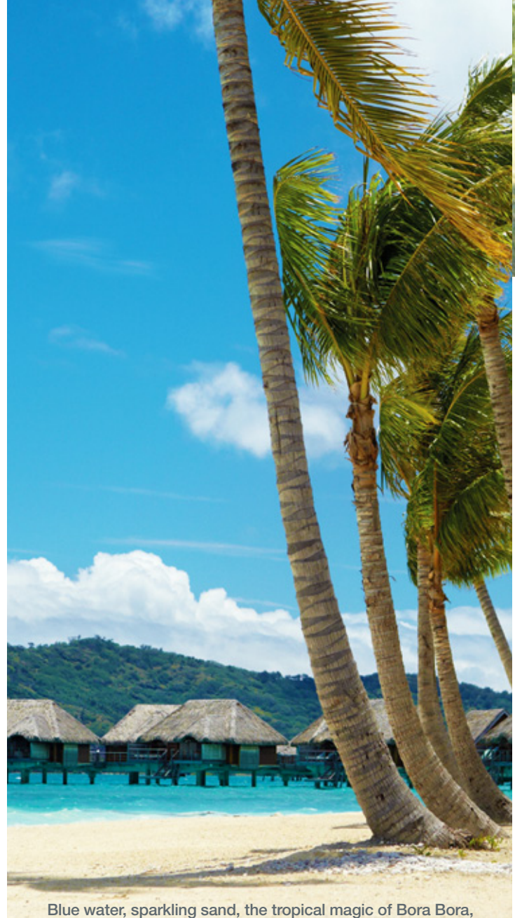
Tahiti. You could be there in fall 2011.

Whatever your dream, we can help you make it a reality.