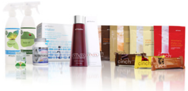
Shaklee products are 100% guaranteed.

Let us show you how, in 15 months, you can drive a new car, earn up to $100,000, qualify for world travel, and start achieving the life of your dreams. All of this by using and sharing products that improve your health and the health of those you love.