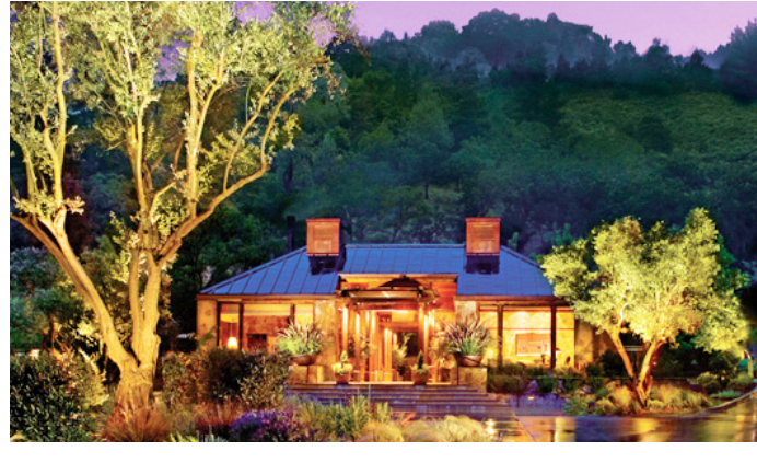
On your way to the top—a luxurious stay at a five-star spa resort in California's lush Napa Valley.

Earn registration for our 2011 Global Conference in Washington, D.C.